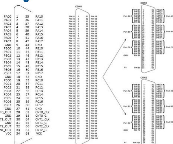
PCIE-1751 Pin Assignments