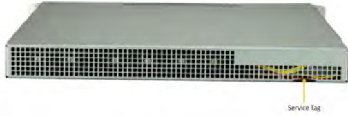
(Rear View - System)