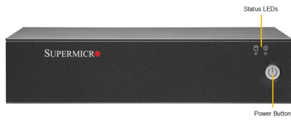
(Front View – System)